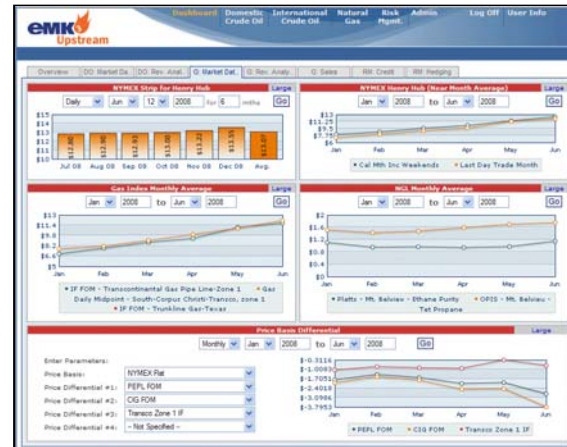
Fig. 2 - Daily Prices for Gas Daily CIG Index